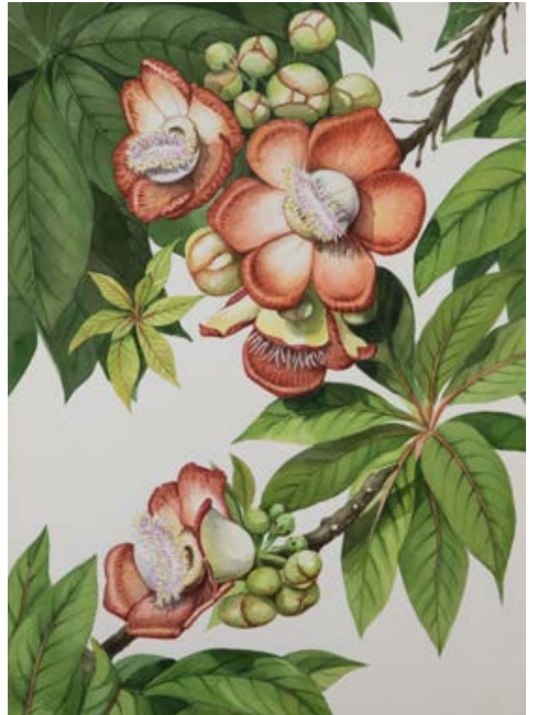
Manabu C. Saito, Couroupita guianensis , watercolor, 1969.